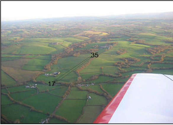
View from NNW