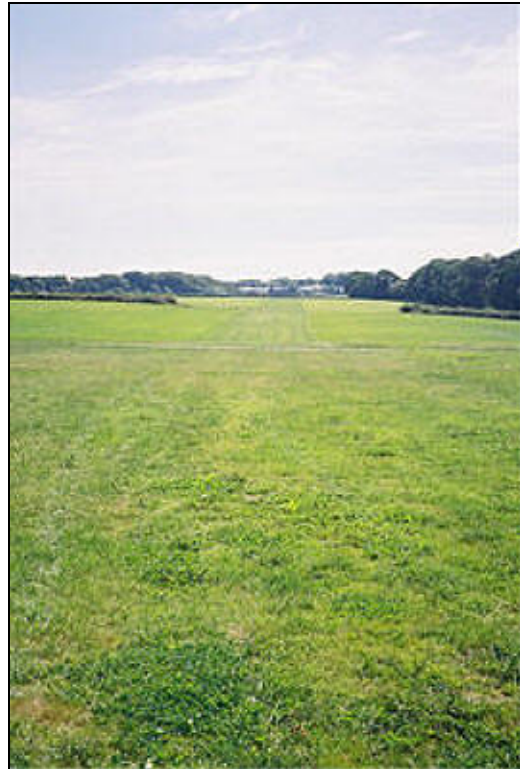
View from 17 threshold