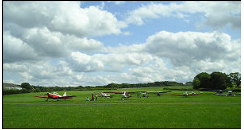
Visitors to Devon Strut Fly-In, 18th July 2004