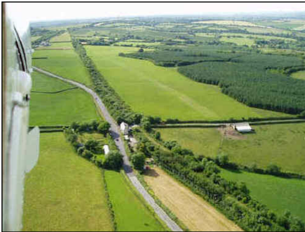
Manstage from SE, app runway 30

STRICTLY PPR Tel. 01837-871518 / Fax. 01837-871298