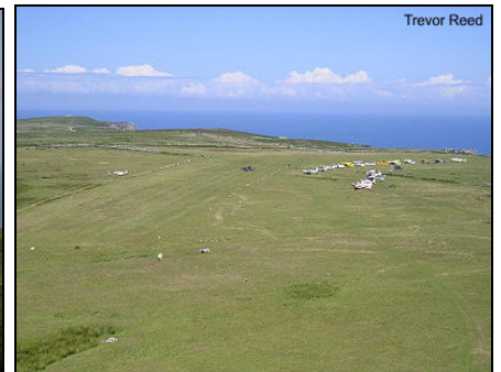
RW 06 from lighthouse

Best surface is between RW24 threshold and half way down strip. Area \frac{3}{4} down 24 strip is roughest.