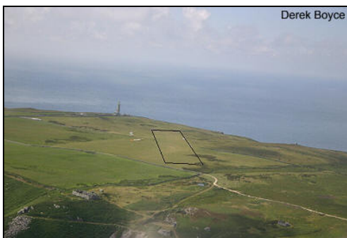
Approach to RW 24

Caution: This airstrip is only suitable for pilot's who are current with short field flying in STOL aircraft. Obtain briefing by telephone before t/o from field of departure. (See photos below for strip orientation). A flyby is advised to examine strip prior to landing. Also keep sharp lookout for dense colonies of sea birds.