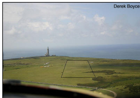
Short finals to 24