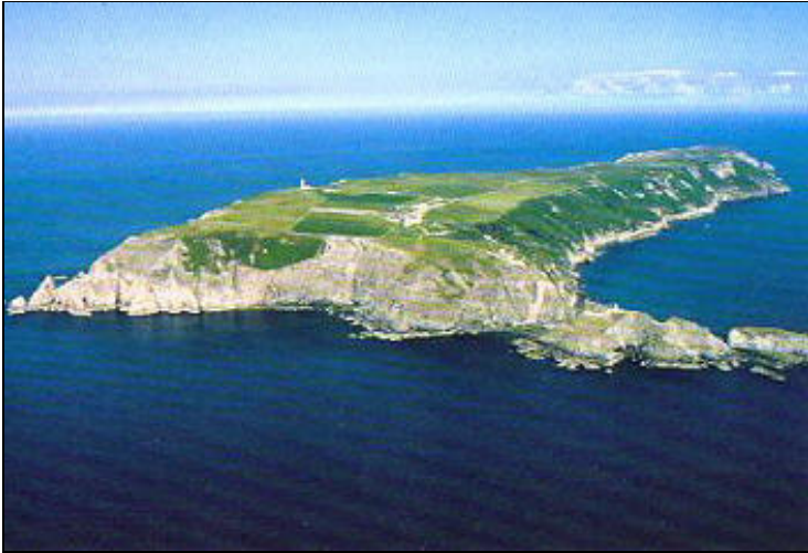
Lundy from South

Operated by The Lundy Island Company, STRICTLY PPR Tel: 01237 431831